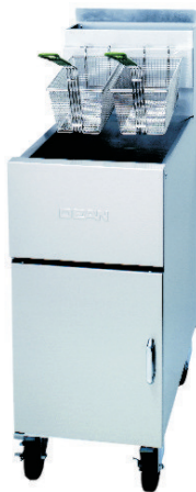
SM40G Shown with optional casters.